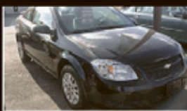
NEW '09 CHEV. COBALT FWD, Cpc., 4-cyl., 5-spd., AC, AM/FM/CD, PS/PB, int. W/W, dual air bags, cloth interior, spoiler. MSRP $16,020. $13,252. Includes Red Tag & Consumer Rebate