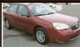
'06 CHEVY MALIBU FWD, 4-dr., 6-cyl., AT, AC, CC, tilt, AM/FM/CD, PW, PDL, PM, int. W/W, dual air bags, 23,468 miles, GM Certified, $10,995