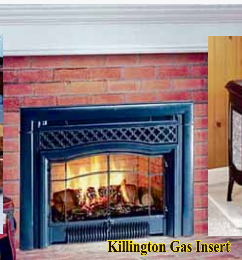
Killington Gas Insert