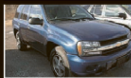
'06 CHEVY TRAILBLAZER LS 4x4, 6-cyl., AT, AC, CC, tilt, AM/FM/CD, PW, PDL, PM, P.seats, PS/PB, int. W/W, dual air bags, alloy wheels, GM Certified, 28,000 miles, $12,995