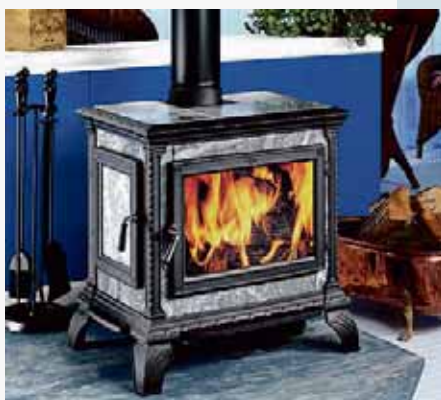
Heritage Wood Stove