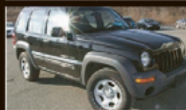
'03 JEEP LIBERTY 4x4, 4-dr., 6-cyl., AT, AC, CC, tilt, AM/FM/CD, PW, PDL, PM, PS/PB, int. W/W, dual air bags, 70,989 miles, $8995