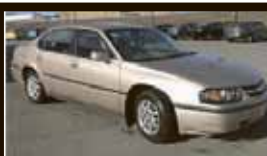
'05 CHEVY IMPALA FWD, 6-cyl., AT, AC, CC, tilt, AM/FM/CD, PW, PDL, PM, GM Certified, 59,000 miles, $8795