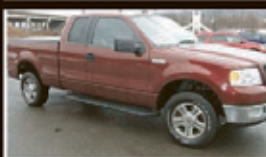
'05 FORD F150 EX-CAB 4x4, 8-cyl., AT, AC, CC, tilt, AM/FM/CD, PW, PS/PB, int. W/W, dual air bags, ABS, alloy wheels, 35,340 miles, $15,995