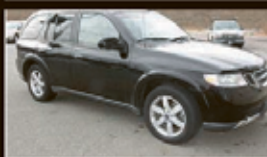
'06 SAAB 9-7X 4x4, 4-dr., 8-cyl., AT, AC, CC, tilt, AM/FM/CD, PW, PDL, PM, P.seats, PS/PB, int. W/W, dual air bags, sunroof, R.def., ABS, alloy wheels, leather interior, 30,455 miles. ONLY 1 LEFT! $16,995