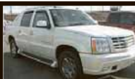
'04 CADILLAC EXT 4x4, 8-cyl., AT, AC, CC, tilt, AM/FM/CD, PW, PDL, PM, P.seats, PS/PB, int. W/W, dual air bags, moon roof, ABS, alloys, leather, Cadillac certified, 30K. $23,995