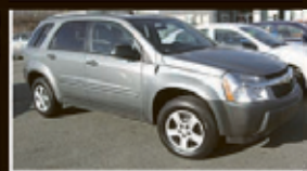
'05 CHEV. EQUINOX LS 4x4, 6-cyl., AT, AC, CC, tilt, AM/FM/CD, PW, PDL, PM, int. W/W, dual air bags, ABS, cloth interior, GM Certified, 47,215 miles, $8995