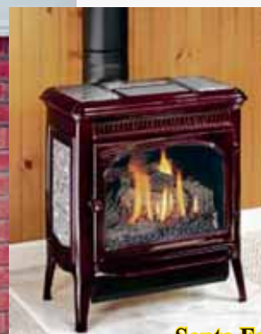
Santa Fe Gas Stove