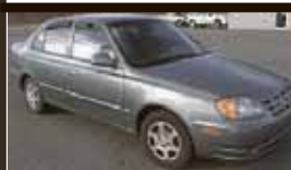
'03 HYUNDAI ACCENT FWD, 4-door, 4-cyl., AT, AC, PS/PB, int. W/W, dual air bags, 78,000 miles, $3995