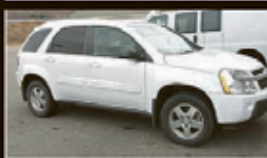
'05 CHEV. EQUINOX LT 4x4, 6-cyl., AT, AC, CC, tilt, AM/FM/CD, PW, PDL, PM, PB, int. W/W, dual air bags, R.def., ABS, alloy wheels, GM Certified. 4 Available! Starting @ $9995