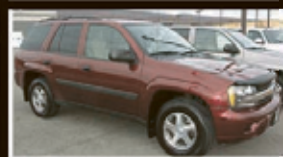
'05 CHEV. TRAILBLAZER 4x4, 6-cyl., AT, AC, CC, tilt, AM/FM/CD, PW, PDL, PM, PB, int. W/W, dual air bags, R.def., ABS, alloy wheels, GM Certified. 4 Available! Starting @ $9995