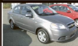
'07 CHEVY AVEO FWD, 4-dr., 4-cyl., AT, AC, AM/FM, dual air bags, R.def., 24,810 miles, 34-MPG! GM Certified, $9485