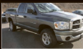
'07 DODGE RAM 4x4, 8-cyl., AT, AC, CC, tilt, AM/FM/CD, PW, PDL, PM, P.seats, PS/PB, int. W/W, dual air bags, R.def., ABS, alloy wheels, 32,000 miles. $16,995