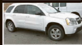
'08 CHEVY HHR LT FWD, 4-dr., 4-cyl., AT, AC, CC, tilt, AM/FM/CD, PW, PDL, PM, PB, dual air bags, alloy wheels, R.wiper, 21,900 miles. GM Certified, $13,995