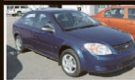
'06 CHEVY COBALT LS FWD, 4-dr., 4-cyl., 5-spd., AC, AM/FM/CD, PS/PB, int. W/W, 42,174 miles. GM Certified Warranty, $10,995