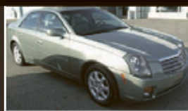
'05 CADILLAC CTS 6-cyl., AT, AC, CC, tilt, AM/FM/CD, PW, PDL, PM, P.seats, PS/PB, int. W/W, dual air bags, ABS, alloy wheels, leather interior, 43,000 miles, $15,995