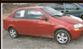
'06 CHEVY AVEO FWD, 4-dr., 4-cyl., AT, AC, PS/PB, int. W/W, 43,602 miles. GM Certified, $7995