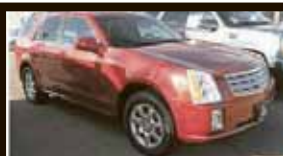
'08 CADILLAC SRX 4x4, 6-cyl., AT, AC, CC, tilt, AM/FM/CD, PW, PDL, PM, P.seats, PS/PB, int. W/W, dual air bags, alloy wheels, leather interior, Cadillac certified, 29K. $23,995