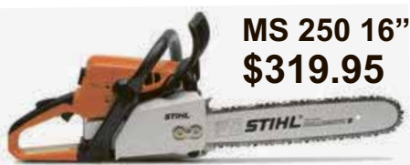
MS 250 16" $319.95