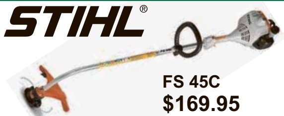
FS 45C $169.95