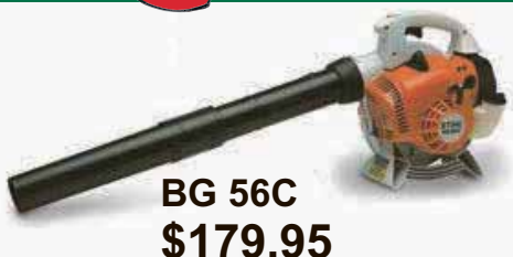
BG 56C $179.95

ACCESSORIES COLLECTOR TOYS GIFT CERTIFICATES & MORE